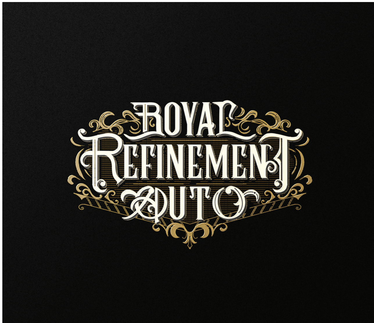
Royal Refinement Auto Logo Design

Client Project done with Procreate, Adobe Illustrator and Adobe photoshop